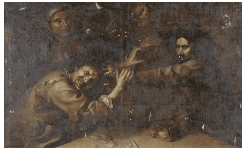
Unknown, Vechtende kaartspelers (Card players fighting), year unknown, inv. no. NK3533