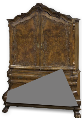
Unknown Dutch cabinet, 1765. Inventory number NK259, 233 x 172 x 66 cm